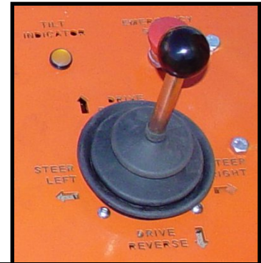
Indelible Control Labels