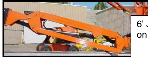
6' Jib Standard on A60JEX