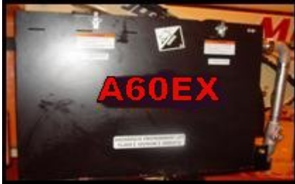
48 VDC 650 Amp-Hr EX Rated Battery