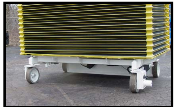
Full 90° Side Steer